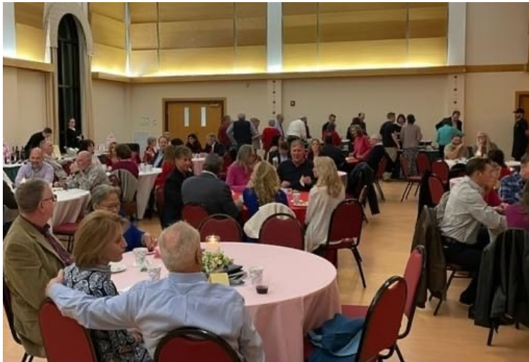
Above: The Celebration of Love and Marriage Event, on February 10, was a wonderful time for couples to reconnect and grow in their relationships and faith.