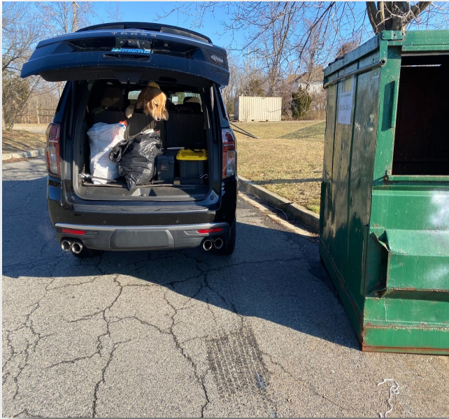
SOPHIA TIRED AFTER A LONG DAY WITH DAD CLEANING UP TRASH ON RIVA RD. AND CENTRAL AVE.