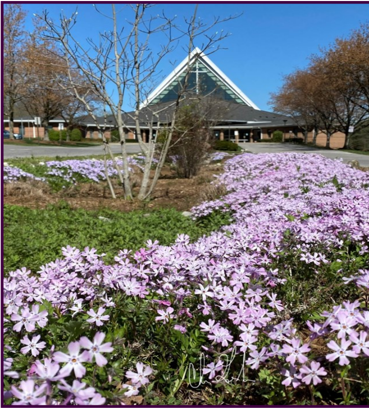
APRIL 23, 2023

Parish Office (Washington line).....301-261-7399 (Baltimore line).....410-269-0586 FAX .....410-798-5315