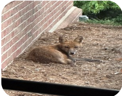
MONDAY MORNING VISITOR "MR. SLY FOX!"