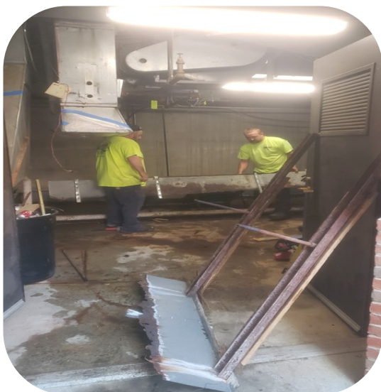
THE NEW HVAC INSTALLATION HAS BEGUN! TWO OF THE MEN HARD AT WORK.!

HVAC CAMPAIGN: As of August 20, we have received $141,825.12 . These gifts, combined with the $50,000 from our reserve fund, gives us a total of $191,825.12 or 30% towards our goal of $630,000!