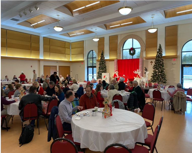
Fun was had by everyone but mostly Santa at Breakfast with Santa last Sunday. Thank you to our KOC for hosting the event.