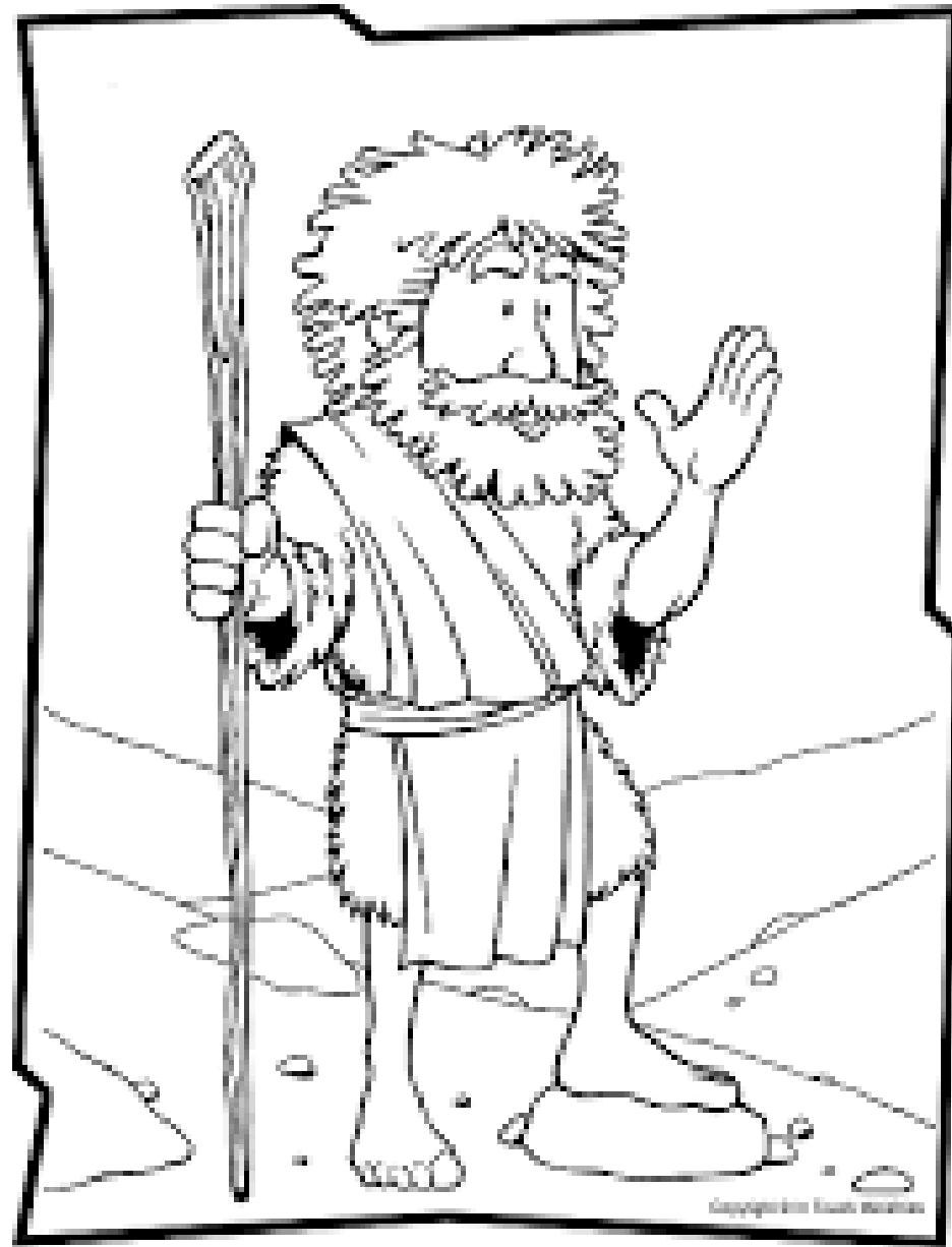
JOHN THE BAPTIST