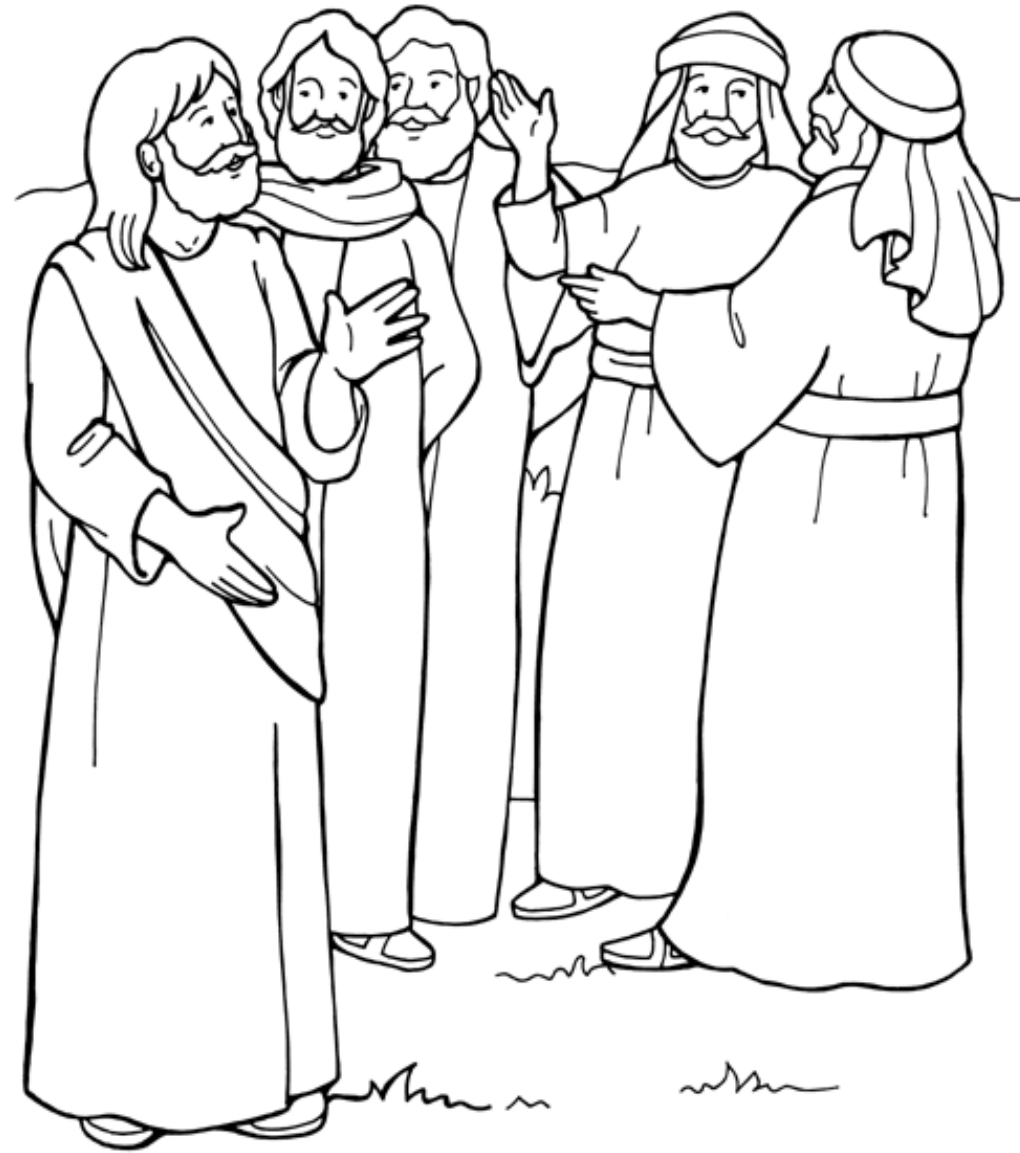
Jesus' First Followers