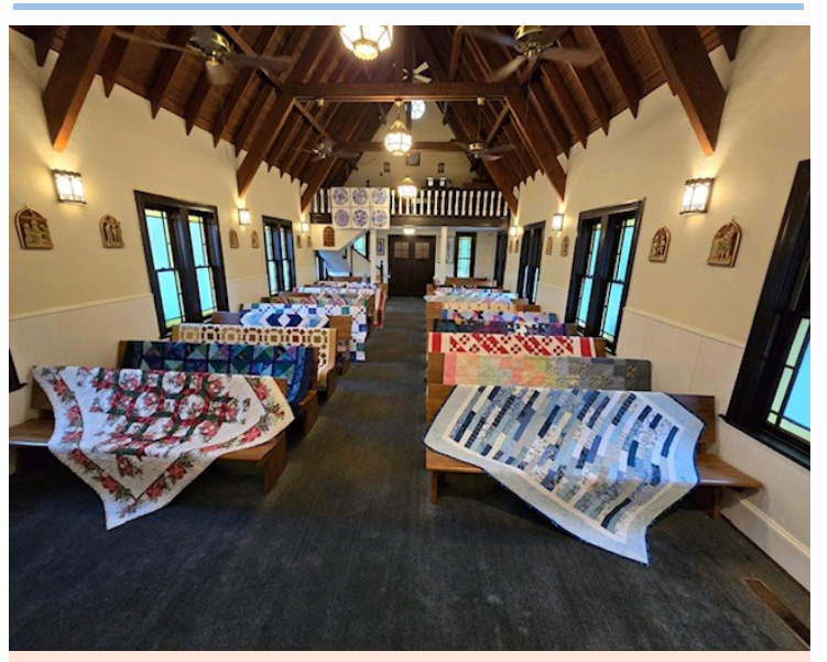
Sew Time Display Quilts for Haiti Quilt Bingo