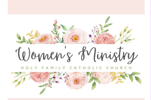
May 14: Women's Ministry Meeting 10am-11:30am Unity Hall