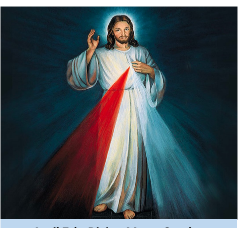
April 7th: Divine Mercy Sunday