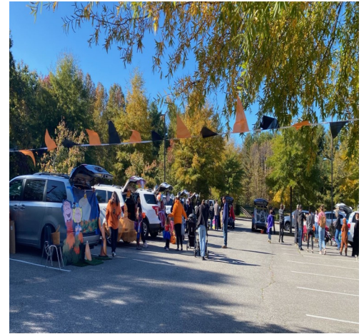
Trunk or Treat! Around 200 in attendance. A great event this year! Thank you to all who joined us!

Making Music, Praying Twice: Come be part of our music class for preschool age children and their parents/guardians. Classes are on Wednesdays, at 10 am in the Children's Library and are held September through May.