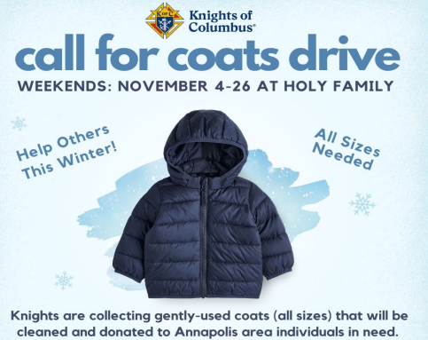
Coats can be dropped off in the Knights of Columbus collection box in the Narthex. Thanks for keeping those in need warm this winter!

or more wreaths to decorate their graves at Annapolis National Cemetery this Christmas season. Our Knights of Columbus Council will be laying wreaths on Saturday, December 16 at Annapolis National Cemetery. Please donate a wreath and/or consider volunteering to lay a wreath by going to: https://www.wreathsacrossamerica.org/ pages/165233/Overview.