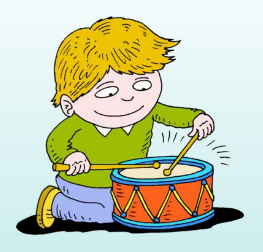
Praise God with the drum

https://www.youtube.com/watch?v=ppuQF_2LqAw